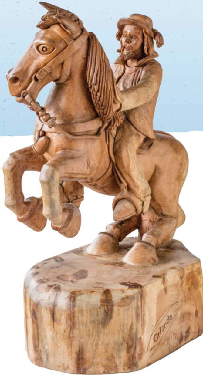
ORLANDO (JLF) José Leite Fernandes Aurora, Ceará Vaqueiro , 2007 Wood, height 30"

Vaqueiros (pronounced 'va-KEHR-ohs') are the cowboys of the dry backlands of the Northeast Brazil, an area known as the sertão ('sehr-TOUN') These cowboys often dressed in leather, drove cattle over large tracts of land, and had the responsibility of caring for them and ensuring their survival. The sertão is a very inhospitable environment and is prone to periods of extended drought called secas (SEH-kahs) when wells and even rivers dry up. Vaqueiros relied on their knowledge of the land and their own resourcefulness to survive.