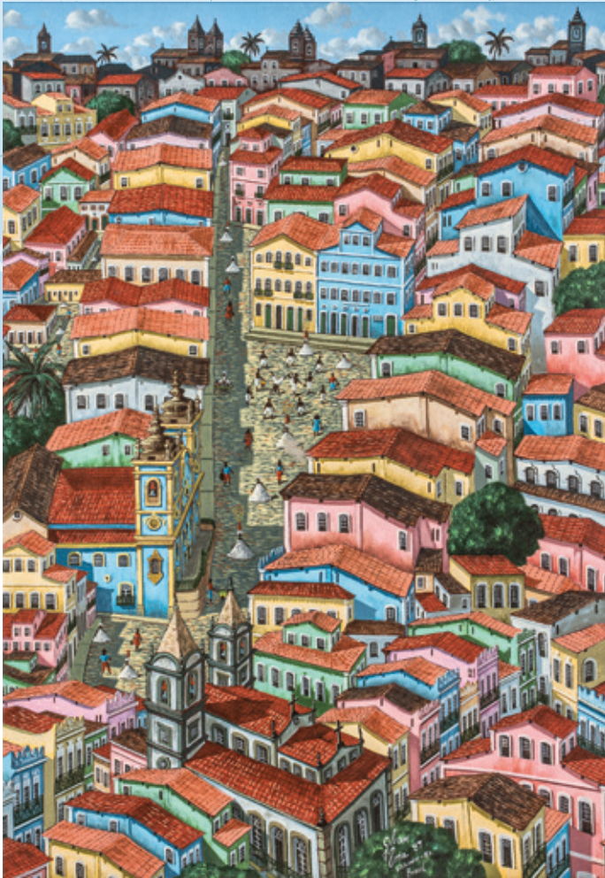
GILVAN LIMA Gilvan de Cruz Lima Salvador, Bahia Pelourinho , 1997 Acrylic on canvas, 27 x 19"

The Pelourinho (pel-oo=REEN-yo) is the historic center of the city of Salvador. Established in 1549, Salvador was the first capital of Brazil. Today the Pelourinho is a UNESCO World Heritage Site and contains the largest concentration of colonial architecture in the Americas.